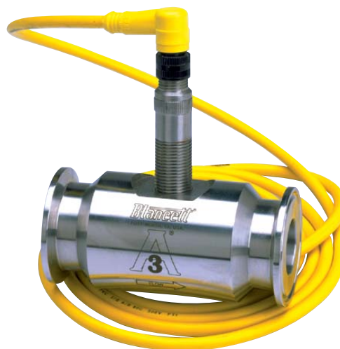
FloClean 3-A (COP) Sanitary Meter with NEMA 6 pick-up (P.N. B16A-110A-1BA)

The FloClean output signal is a sine-wave that is proportional to volumetric flow. With optional Blancett electronics, FloClean provides local flow rate and volume totalization and will interface with most displays, PLCs and computers.